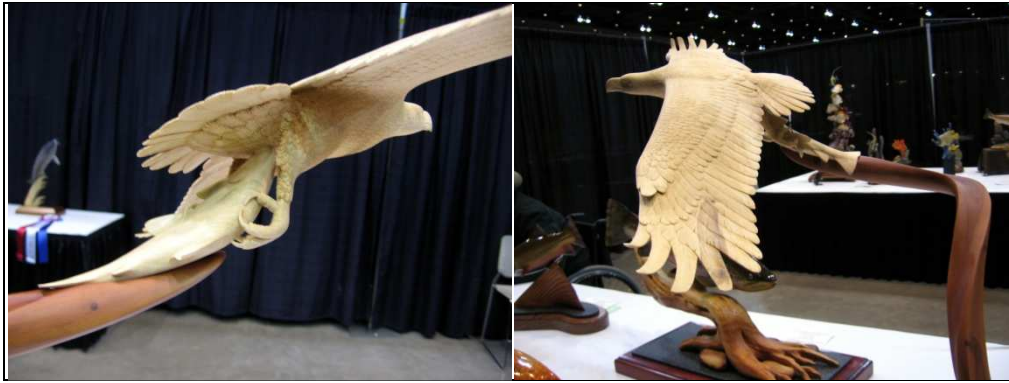
Natural Finish Realistic