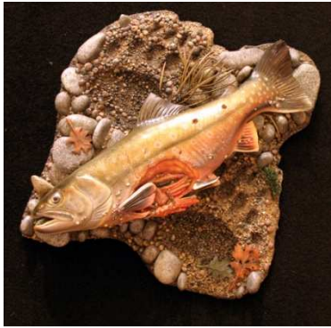
Decorative LS Wall Mount