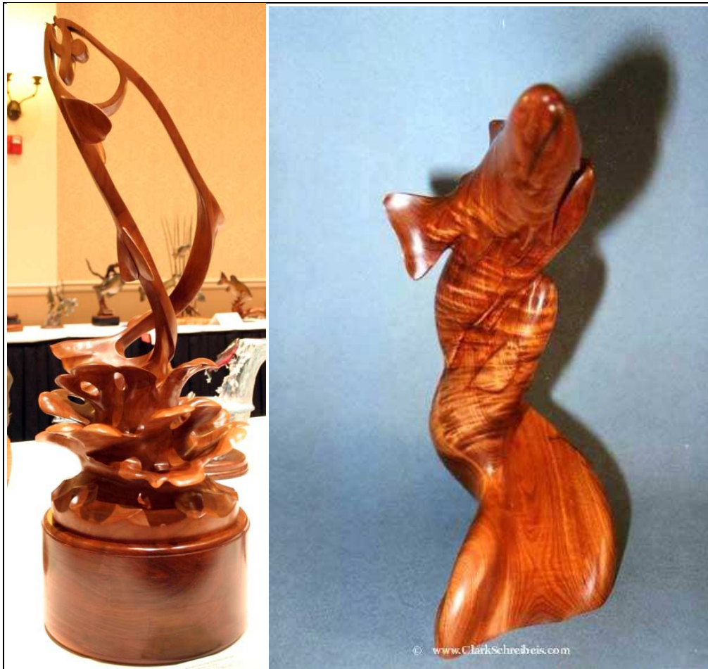
Natural Finish Interpretive

Section 17.1 thru 17.5 explanation: The decorative miniature section also has a short description, no pun intended. Basically, it gives the maximum length the fish can be carved at as “eight” inches. Additionally, it states that you have the latitude to carve in this division at half the length or less of the life-size fish. For example, a large adult Bluegill can grow to 12 inches. You could carve it at half that, 6” or a maximum of 8”. However, a 36” Northern Pike may not be carved half sized, it must be carved at the 8” maximum. This rule helps keep this a truly “miniature” division. Again, all of the Decorative Life-size rules in section 15 apply to this section 17.